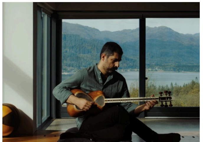
Making Tracks Residency, 2022