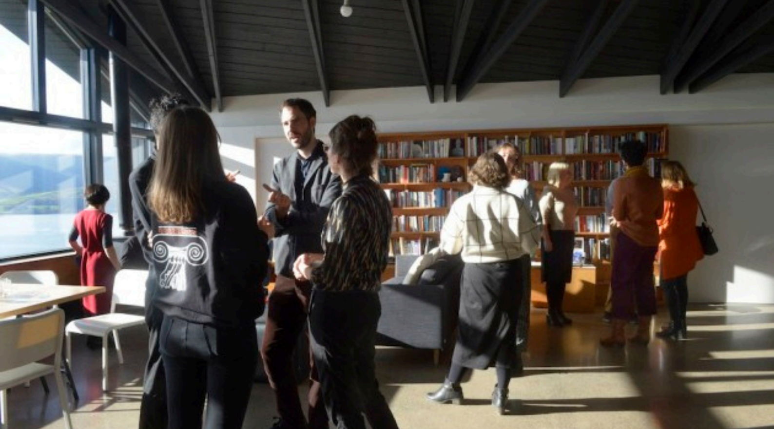
The launch of the Scotland/Japan residency exchange programme at Cove Park, October 2018

If you are a UK taxpayer, the value of your gift can be increased by 25% under the Gift Aid scheme at no extra cost to you.