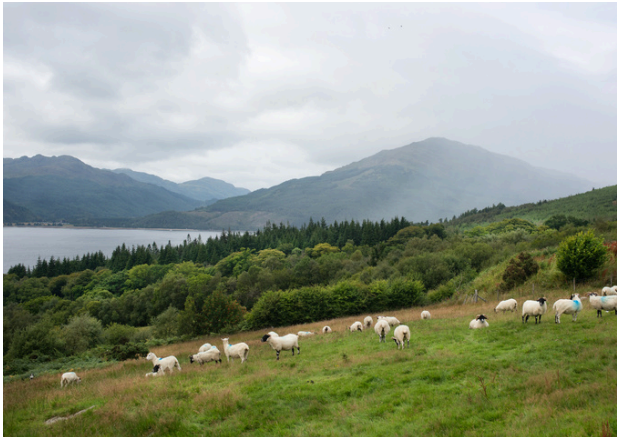
View of Cowal Peninsula, Autumn

Cove Park overlooks Loch Long, a sea loch flowing into the Firth of Clyde and on to the Atlantic. This location connects Cove Park to Argyll's rich history and natural heritage, its numerous sea lochs, islands, peninsulas, shorelines, and Atlantic rainforests. The site itself has an eclectic history and we have maintained the principles of the former conservation park, continuing to host sheep and Highland cows, and managing grazing pasture so that the site's rich biodiversity can flourish. To support this, 500 native trees were planted in 2022 by resident artists, local community volunteers, and our team to create a new micro-rainforest for Argyll.