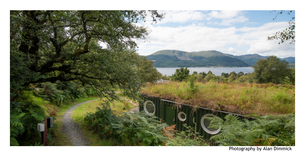
PROGRAMME INFORMATION & APPLICATION GUIDELINES

Residency Dates: Monday 4 September - Sunday 17 September 2023 Deadline for Applications: Monday 26 June 2023 (by noon)